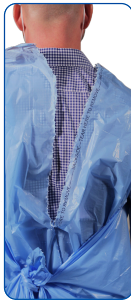
For removal, tear perforation on back side of gown

These polyethylene, non-surgical isolation gowns are easy to put on (don) and take off (doff). The full length, long sleeve style provides full coverage. The sleeves include a thumb loop to secure the sleeve.